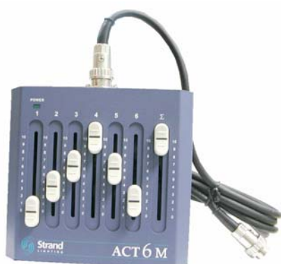
64311 Act 6 Digital Fader Panel