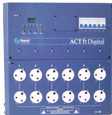
75421 ACT 6 DIGITAL with UK 15A connector